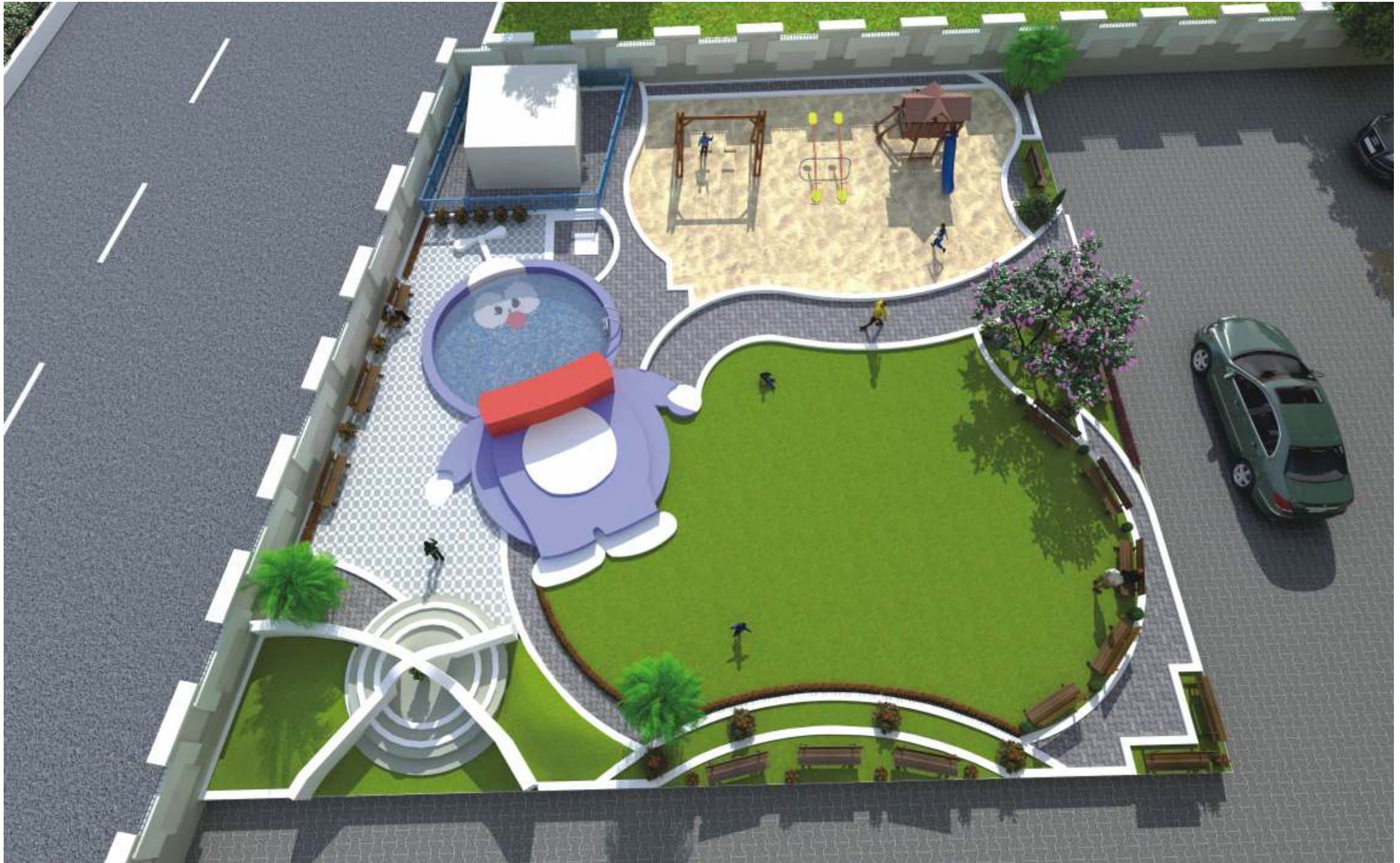
2 & 3 BHK LUXURIOUS APARTMENTS | AT DAPODI