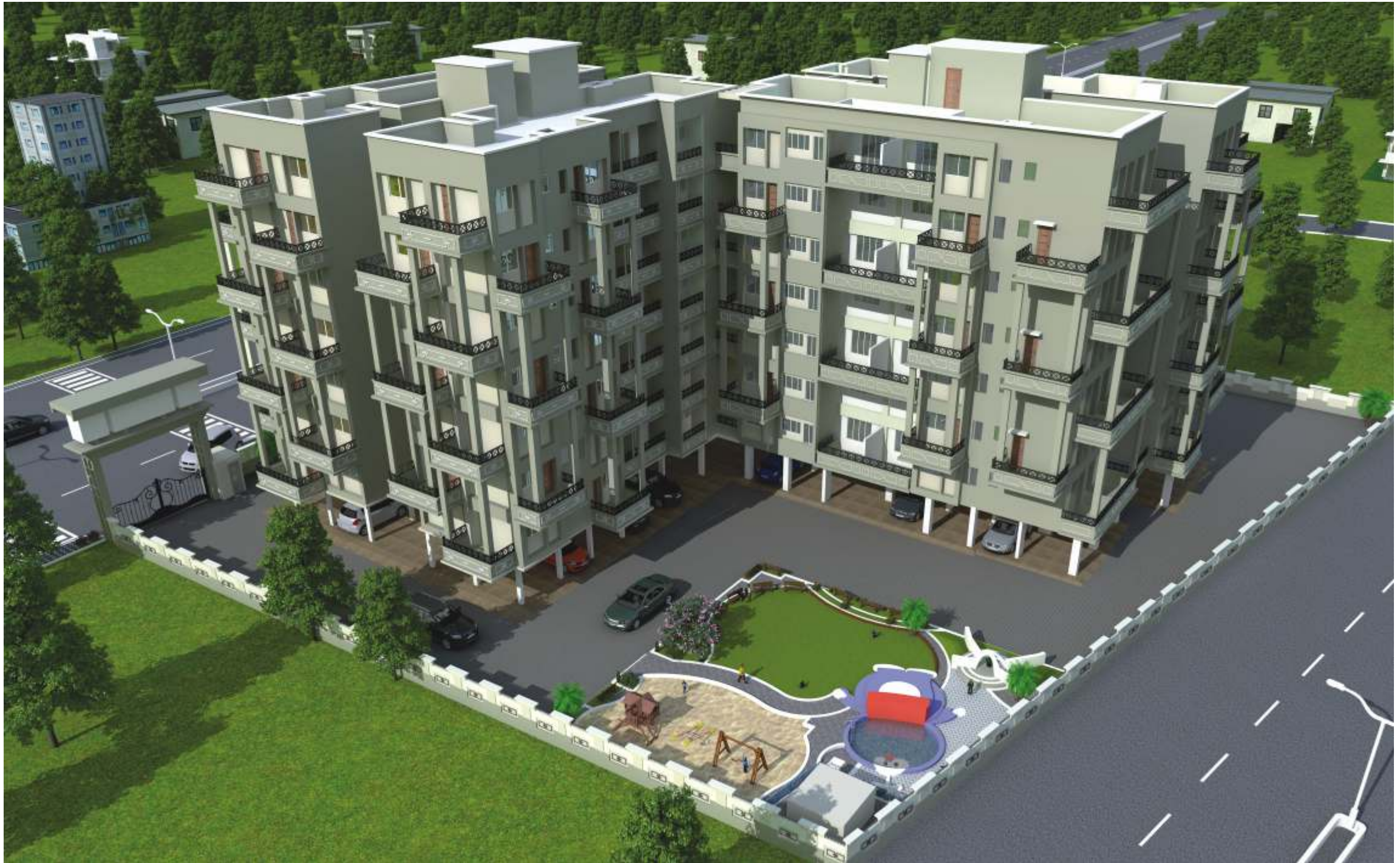
2 & 3 BHK LUXURIOUS APARTMENTS | AT DAPODI